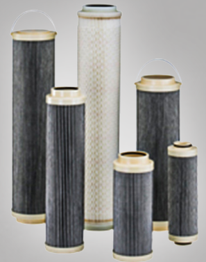
HyPro Filter Elements

panels. Because we were onsite during the initial testing and proving stage, both our customer and the end user's became very educated on cleanliness levels and fluid conditioning.